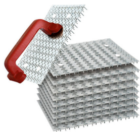
Scratcher mini kit (1 handle + 10 grids small teeth)

Better efficiency by working parallel to the facade. Reduction of wrist disorders.