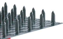
"Sweet" large teeth Length 15 mm