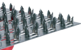
"Agressive" small teeth Length 8 mm