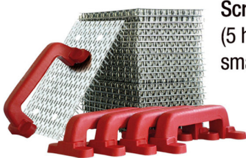
Scratcher kit (5 handles + 40 grids small teeth)