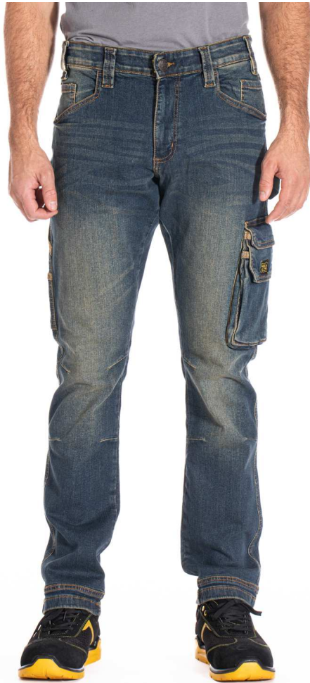
Ref. JOBDY Denim Dirty

Jeans de travail, multi-poches, taille haute, double ceinture intérieure avec élastique «antidérapant», braguette zippée, cuisse confort avec poche pour téléphone portable, jambe droite avec pinces aux genoux. Denim stretch Fibreflex® dirty 98% coton, 2% élasthanne - 366 grammes.